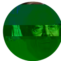
Alfred E. Mirsky Professor The Rockefeller University New York City, USA