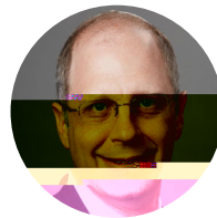
Department of Psychiatry Boston Children's Hospital, Boston, USA

Jeanne Timmins Amphitheatre, The Neuro, 3801 University Street, Montreal